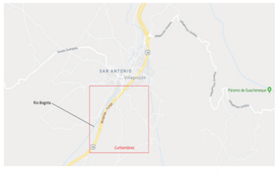
Figure 1. Location of Villapinzon Tanneries [9]

Globally, the tanning industry is on par with the worst polluters, and every year significant financial resources are spent in an attempt to repair the negative effects of its activities, and to a lesser extent in the prevention of these negative externalities. The funds allocated for this purpose are intended to comply with environmental parameters (such as what is strictly necessary at the administrative level to obtain environmental licenses) and to avoid penalties involving economic payment [8]. The Corredor study makes important reference to the treatment of liquid waste generated by tanneries that pollute the upper basin of the Bogotá River coming from the municipality of Villapinzón, Cundinamarca (where an important cluster associated with fur work is located), to the San Benito neighborhood in the city of Bogotá, where the waste from their activities is carried by the Tunjuelito River to the Bogotá River. In Figures 1 and 2, maps with the location of these tanneries around these tributaries are presented: